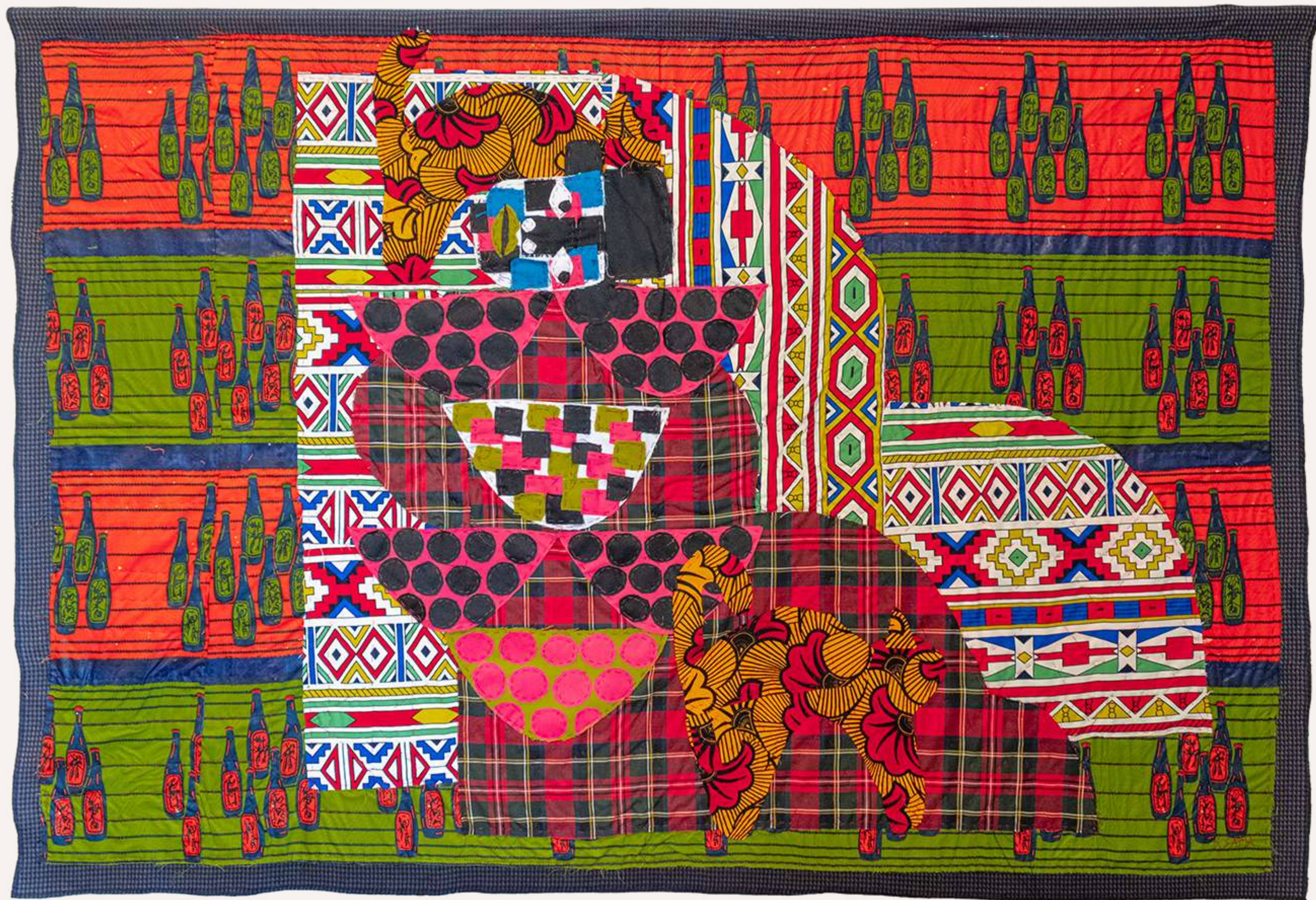
CAT GOT YOUR TONGUE? (2023) Tweed, cotton, wax fabric, polyester 112 x 165 x 1cm (44.8 x 66 x 0.4 inches) USD 2,850 excl 15% SA vat