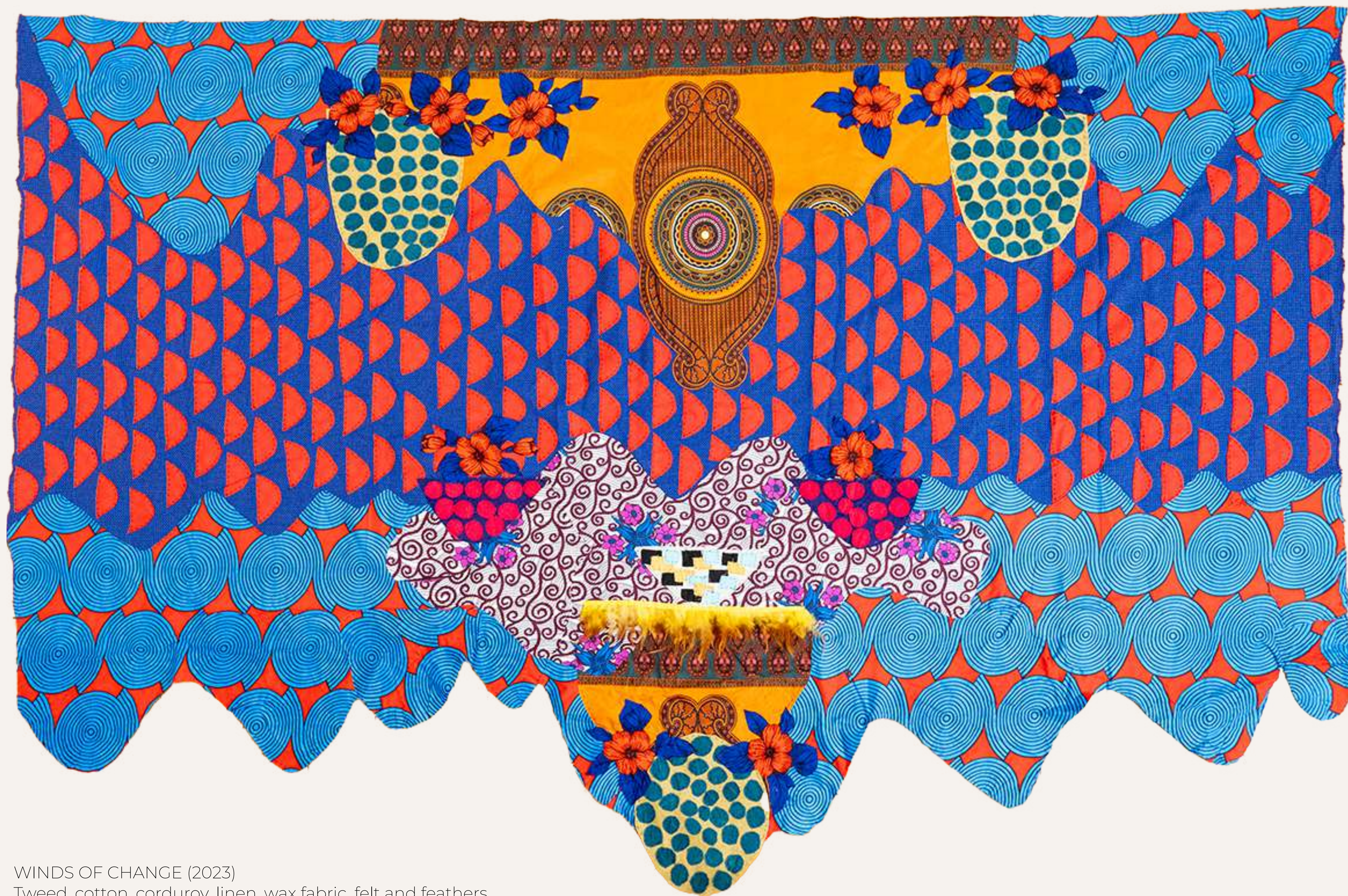
WINDS OF CHANGE (2023) Tweed, cotton, corduroy, linen, wax fabric, felt and feathers 200 x 311 x 1cm (80x 124.4 x 0.4 inches) USD 4,300 excl 15% SA vat