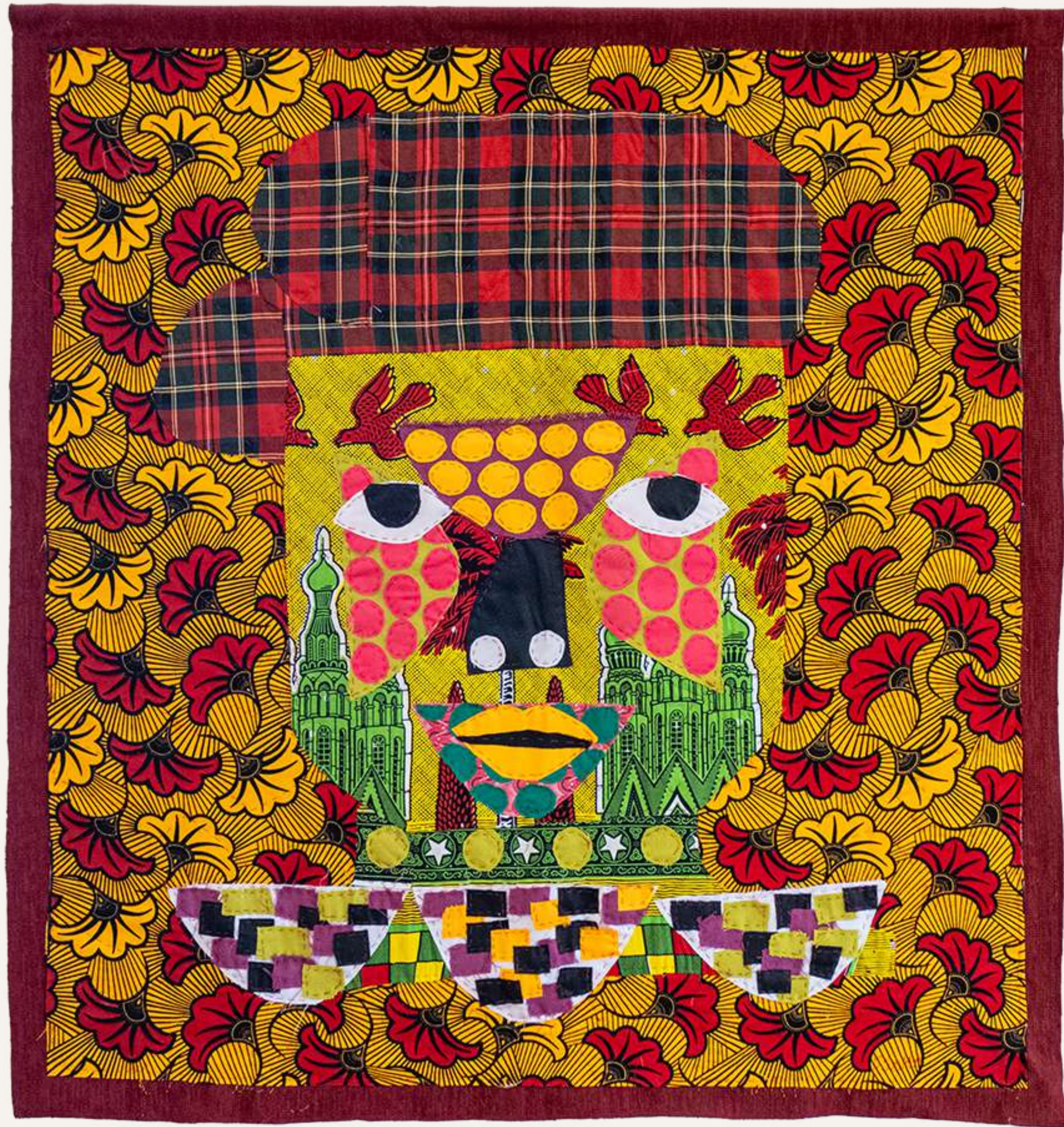
CHECKMATE (2023) Tweed, cotton, wax fabric, polyester 128 x 122 x 1cm (51.2 x 48.8 x 0.4 inches) USD 2,300 excl 15% SA vat