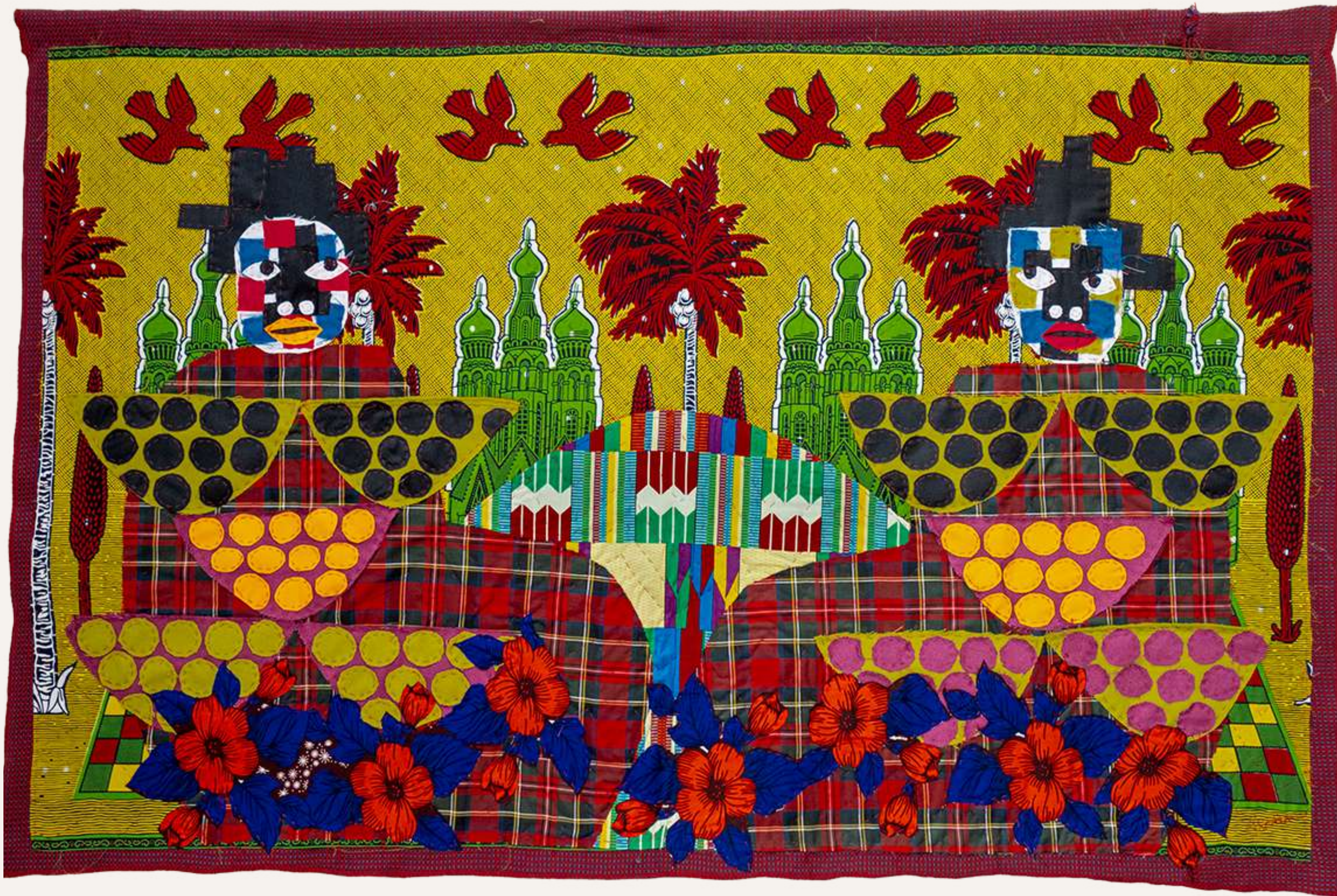
REPENT YOUR SINS (2023) Cotton, wax fabric, tweed, polyester 110 x 168 x 1cm (44 X 67.2 x 0.4 inches) USD 2,850 excl 15% SA vat