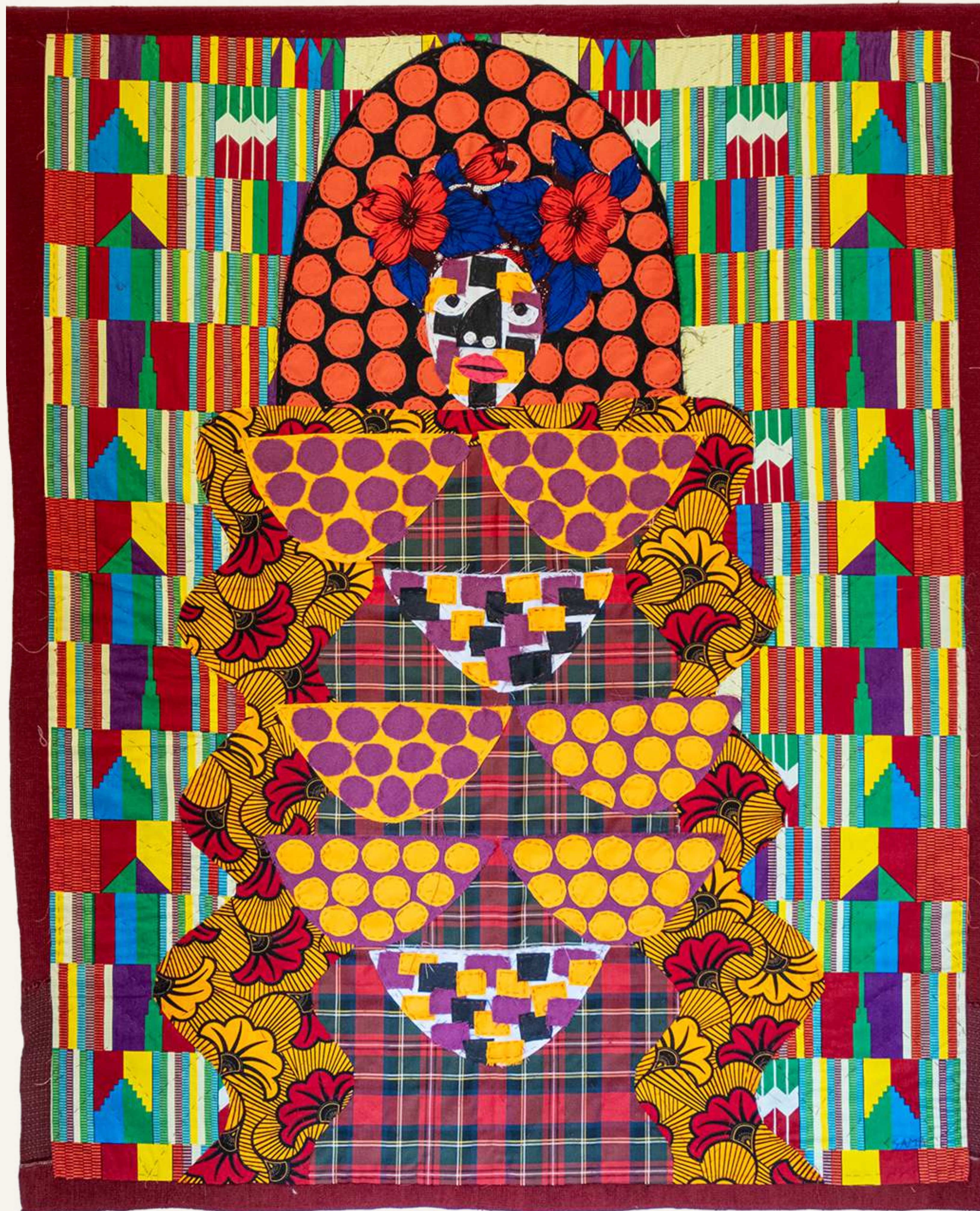
SELFISH (2023) Tweed, cotton, wax fabric, polyester 150 x 122 x 1cm (60 x 48.8 x 0.4 inches) USD 2,500 excl 15% SA vat