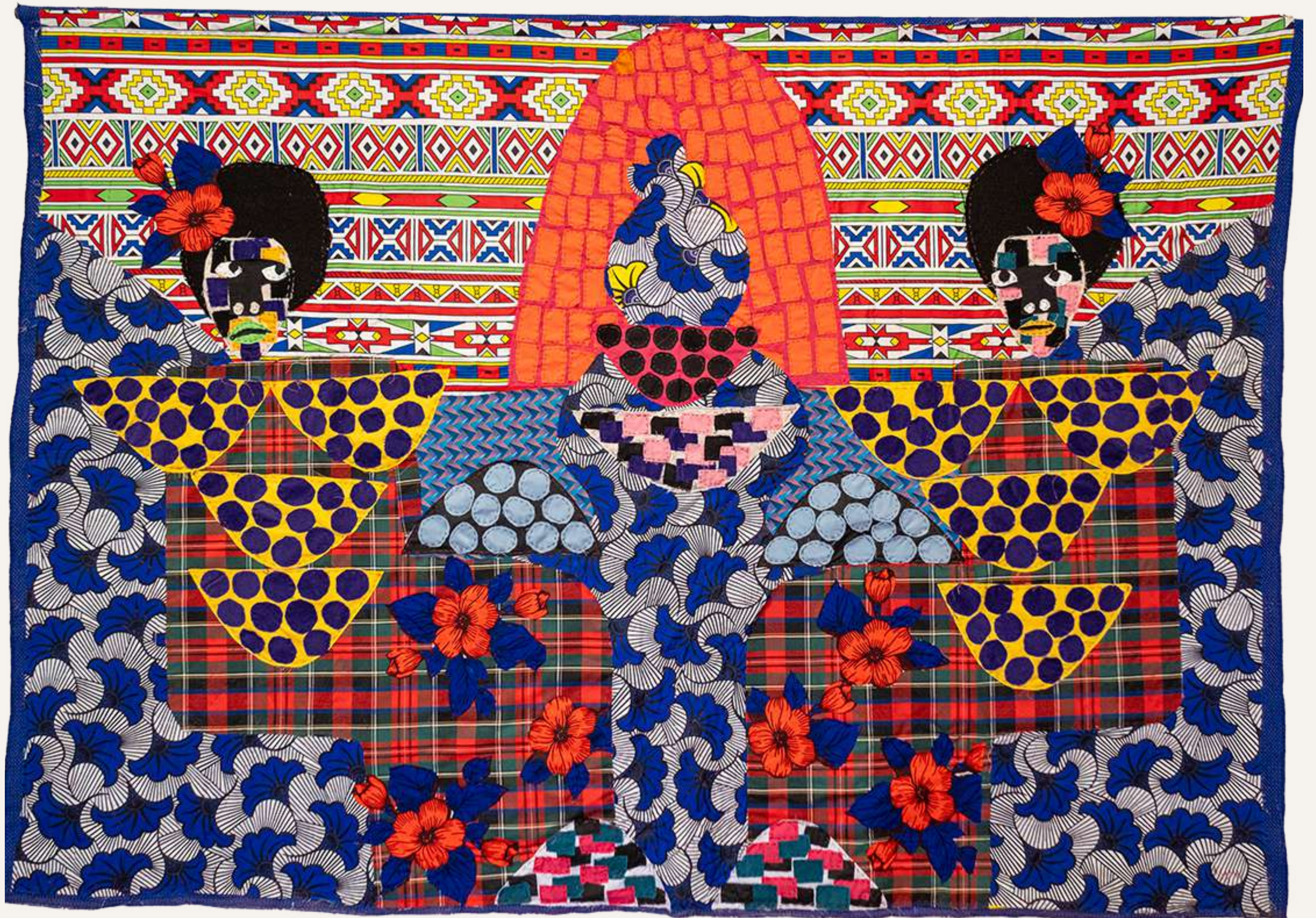
SHE READ HER FOR THE GODS! (2023) Corduroy, linen, wax fabric, tweed,, cotton 141 x 200 x 1cm (56.4 x 80 x 0.4 inches) USD 3,100 excl 15% SA vat