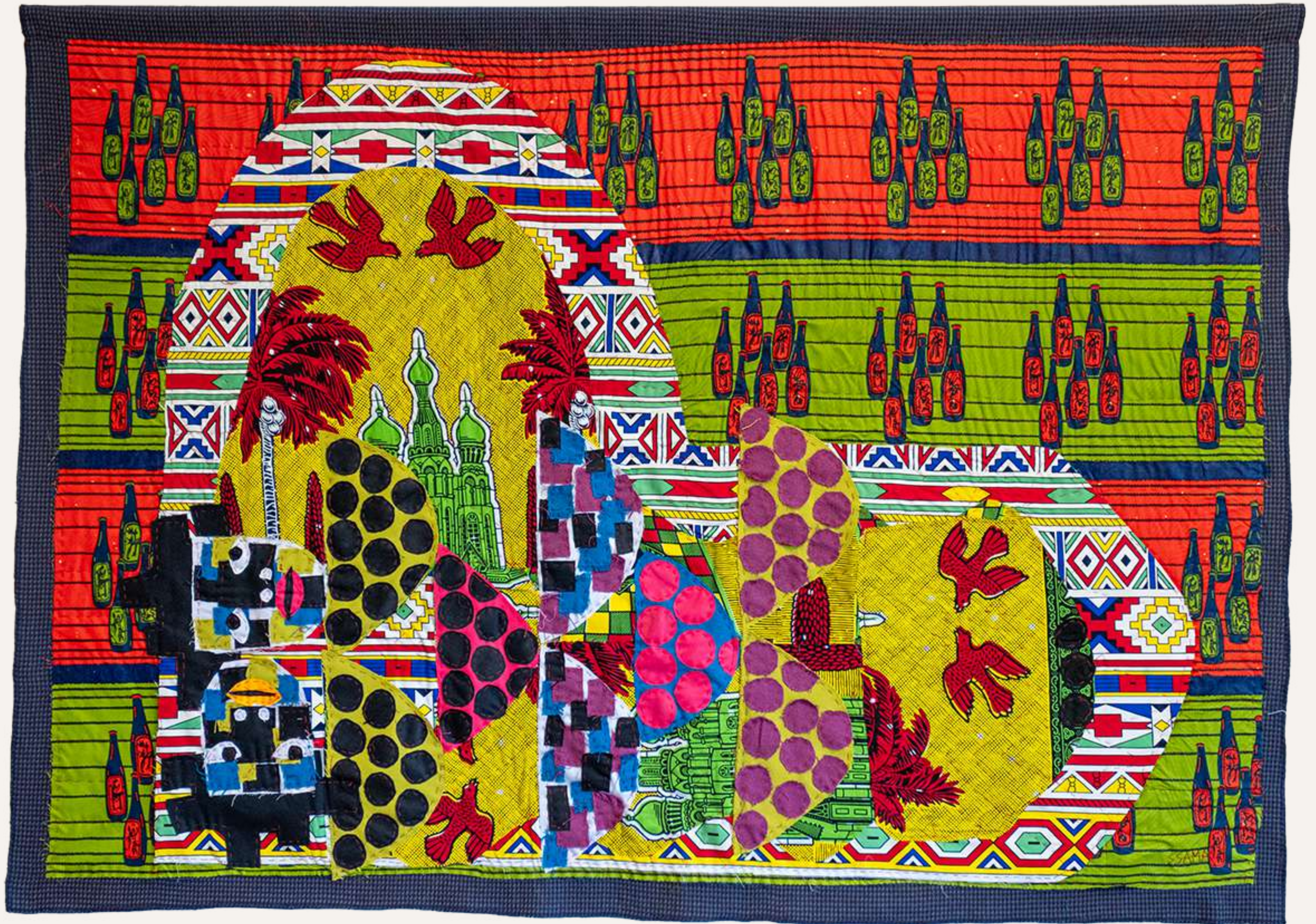
YOU MADE YOUR BED, NOW LAY IN IT (2023) Cotton, wax fabric, tweed, polyester 115 x 162 x 1cm (46 x 64.8 x 0.4 inches) USD 2,850 excl 15% SA vat